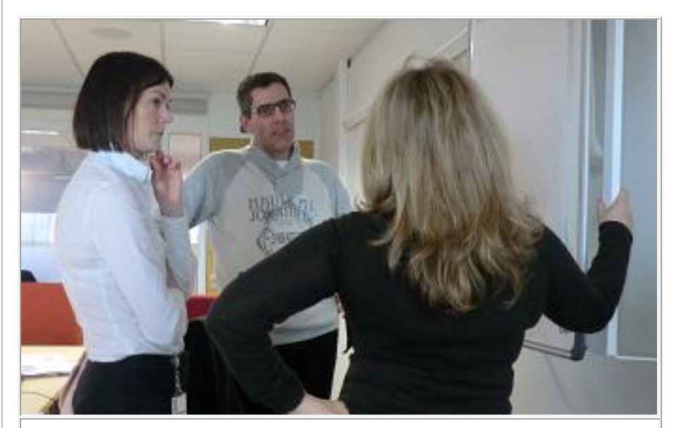
Discussing learning at a team Retrospect in Sweden

Contact Knoco for advice on your capturing your KM knowledge.