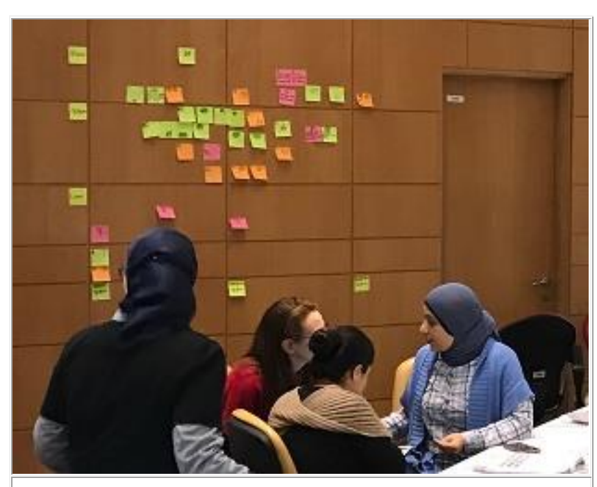
Delegates at the Tunisia training workshop

Knoco is the registered trademark of Knoco Ltd.